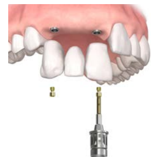
Placement of final restoration.