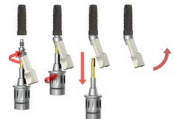
Positioning and tightening of abutment