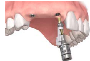
Pre-mounted abutment holder