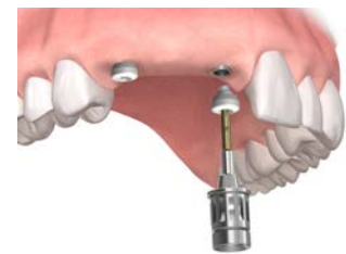
Placement of Healing Abutment