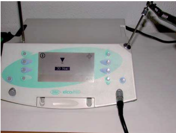
Figure 1. The Elcomed drilling unit used in the study. The handpiece was calibrated before each use (right).

Spearman's rho test was used to test for possible correlations. A statistically significant correlation was considered if p < 0.05 .